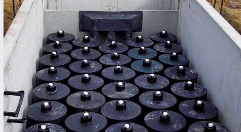
Images for illustrative purposes only. TNSA SCM Committee does not endorse specific proprietary SCMs or assist with selection.